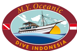
PT Inner Seas Adventures